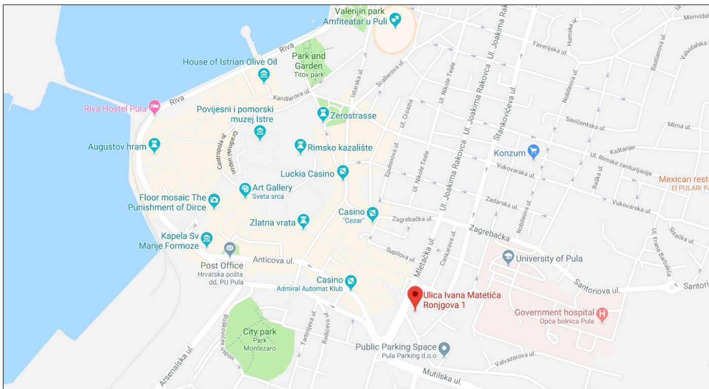
Map of central Pula showing location of the conference venue (ul. Ivana Matetića Ronjgova 1, 52100, Pula)